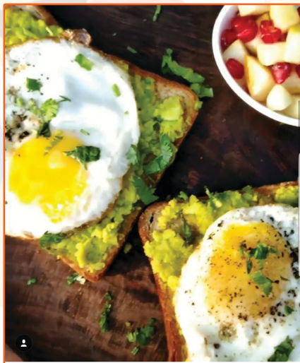
330 views • Liked by kebabmaikhadi thehungryhooman A good day starts with a fine and satisfying breakfast. So head to the Orka Cafe for the perfect dine in meal. The whole grain toasted bread along with the mashed Avocado and Fried Eggs is how I started my day. Wake up to the Tasty, Nutritious and High Protein Breakfast to fuel you through the morning. In frame - Sunny Avo Toast (231kcal) Price - ₹195